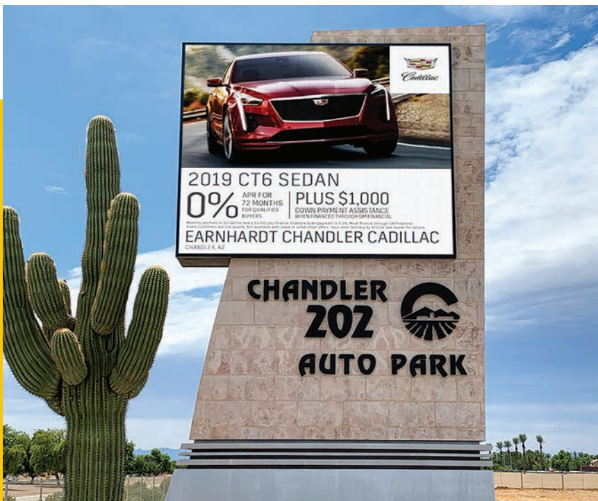
Pearson's Sign Co. | Chandler 202 Auto Park | Chandler, AZ | 16mm | 540 x 666 | 31' x 38'

Our patented innovations simplify design and installation to save you time and money.